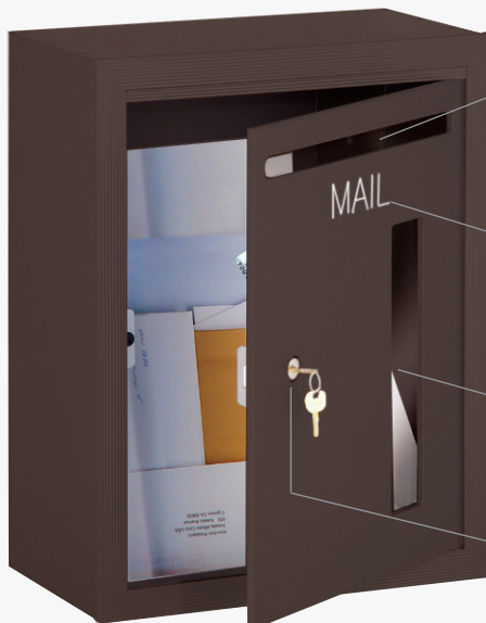
#2240 surface mounted unit in bronze finish displayed

Note: #2260 and #2265 are available in private access only and include a commercial lock.